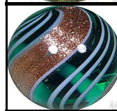
21/32" F. WILGANOWSKI TRANSPARENT BANDED LUTZ