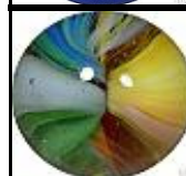
MINT 5/8" AKRO AGATE FLUORESCENT SPARKLER #1