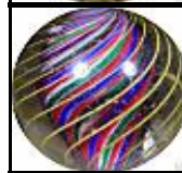
2-1/8" STRIPED SOLID CORE (GROUND PONTIL)