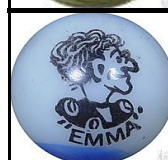
MINT 21/32" PELTIER PICTURE MARBLE, EMMA