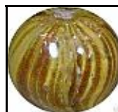
3/4" ONIONSKINLUTZ (LIGHTLY BUFFED)

www.buymarbles.com/marble_id_2.html www.christensenagate.com/default.asp http://grandpamarble.com/html/all.html www.marblesgalore.com/page/3/