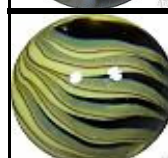
MINT 19/32" CHRISTENSEN YELLOW- BLACK FLAME