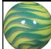
MINT 19/32" CHRISTENSEN GREEN-YELLOW FLAME