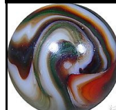
MINT 19/32" PELTIER NLR BURNT CHRISTMAS TREE